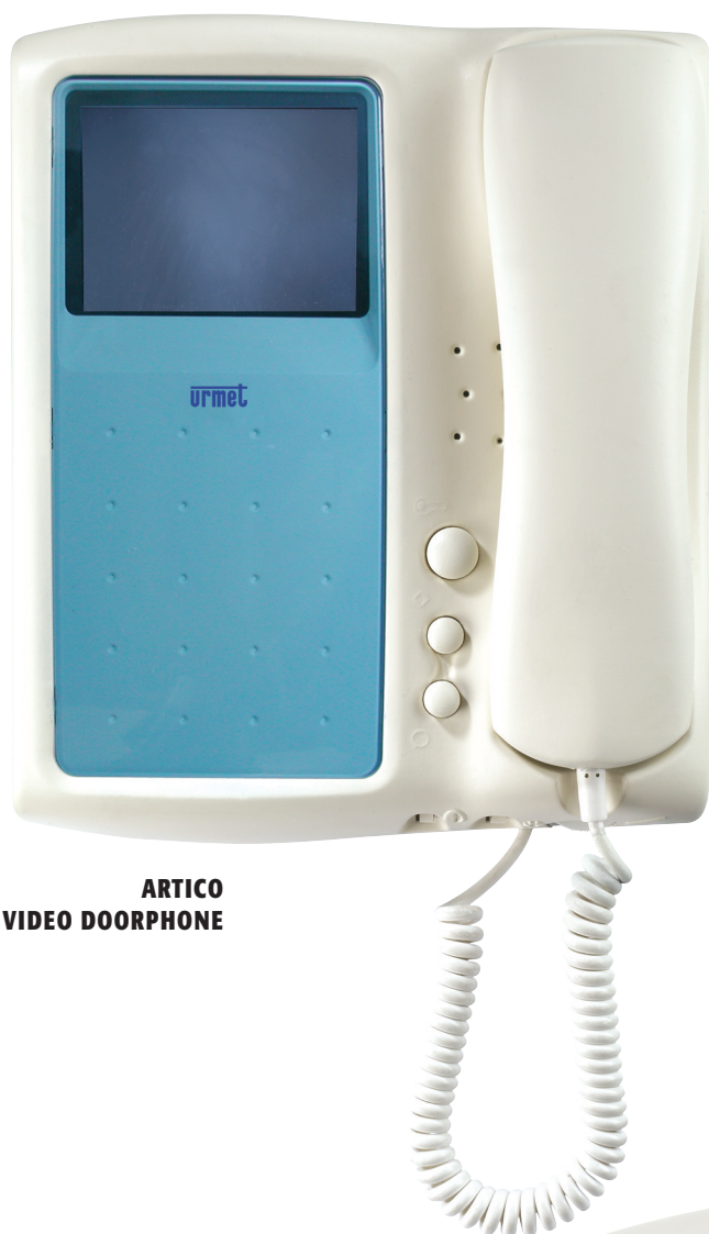
ARTICO VIDEO DOORPHONE